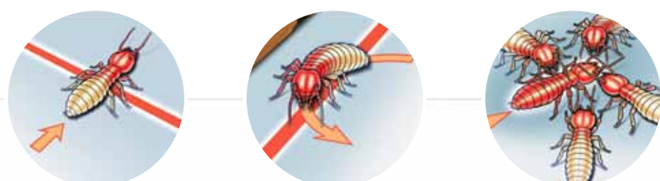
Termites can't detect the Premise Treated Zone. Once exposed to Premise, termites stop feeding and soon die. Termites exposed to Premise transfer the product to unexposed colony members through social interaction and cannibalism.

Premise can provide protection against termite damage for five years. This is backed up by local research carried out in conjunction with CSIRO.